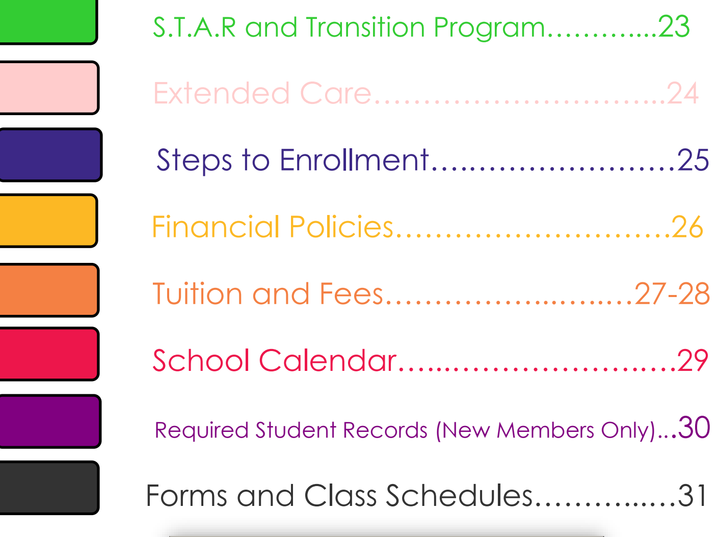
TABLE OF CONTENTS CONTINUED